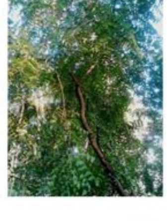
Fig. 1. Azadirachta indica (Neem tree)

of neem (Ganguli, 2002). Neem elaborates a vast array of biologically active compounds that are chemically diverse and structurally complex. Medicinal properties of the plant Azadirachta indica were studied by several workers. They were anti-synergic (Ojapany and Ezeukwu, 1981; Khattak et al., 1985), anti-malarial and anti-tumour effect (Fujisawa et al., 1982), anti-ulcer effect (Pillai and Sarthakumar, 1984), anti-diabetic effect (Patel et al., 2013), anti-fertility effect (Sinha et al., 1984), effect on central nervous system and antioxidant activity (Bandyopadhyay et al., 2002).